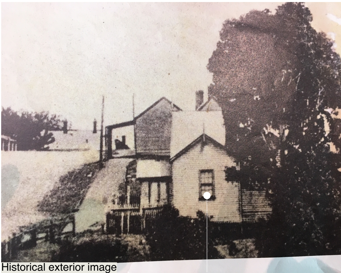
Historical exterior image

Reinstate original galvanised zinc roof.