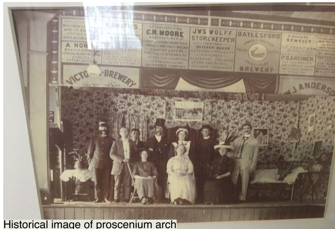
Historical image of proscenium arch