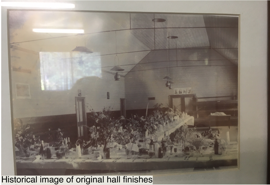
Historical image of original hall finishes

Retain and make good the existing ceiling timber lining boards.